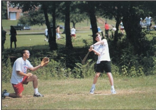
One of the many activities that Boys State Members participate in.