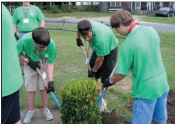
2009 Boys Staters helped build a park for the City of Tuscaloosa.