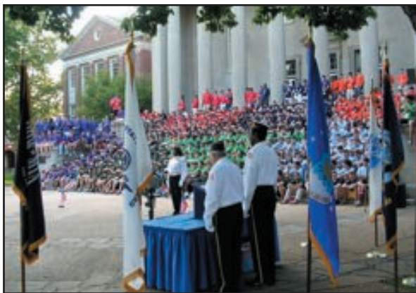
2009 Boys Staters participates in flag retirement ceremony.